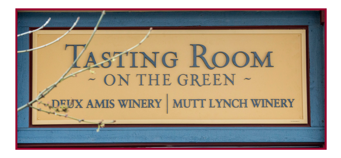
Open Monday - Saturday 11 - 6, Sunday 12 - 5

Wines can be ordered online at <a href="www.deuxamiswines.com">www.deuxamiswines.com</a>, by sending an email to <a href="friends@deuxamiswines.com">friends@deuxamiswines.com</a>, or by calling 707-431-7945. Thank you for your support!